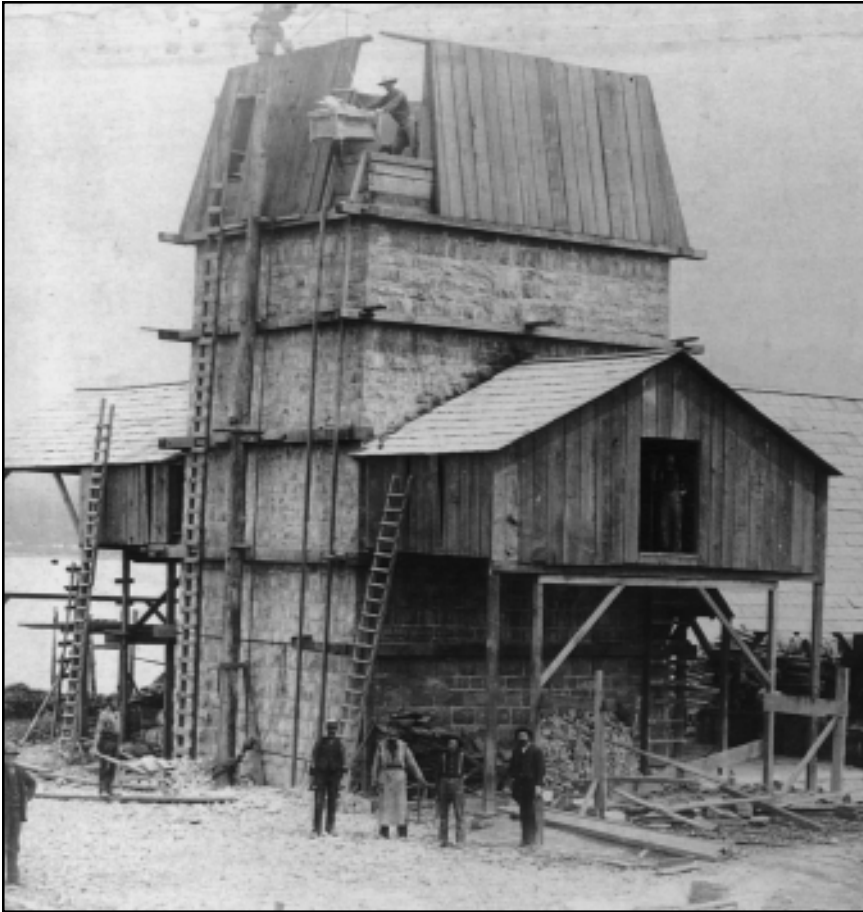
Vancouver, BC: San Juan Lime Company Kiln: many such works were erected in the colonial period to burn limestone and make quicklime (CaO) from which lime mortar was produced. Photo c1888. BCA HP009184