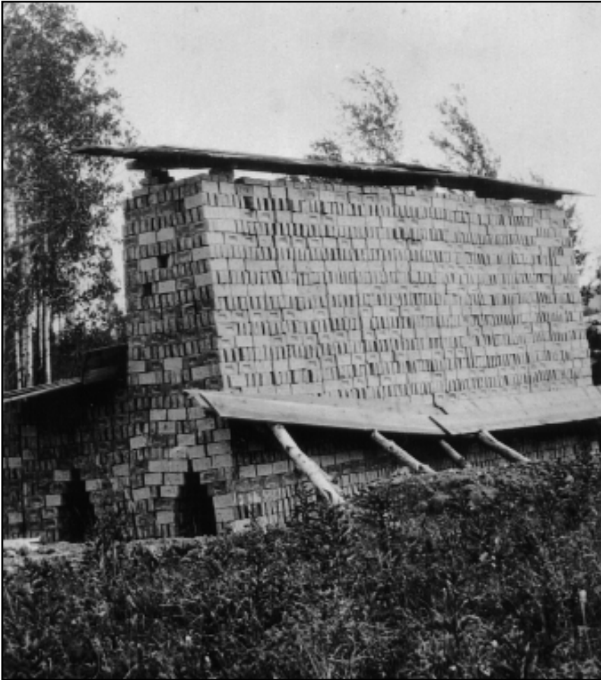
Fort Fraser Brick Yard, Fort Fraser, BC: first kiln of bricks, c1914.