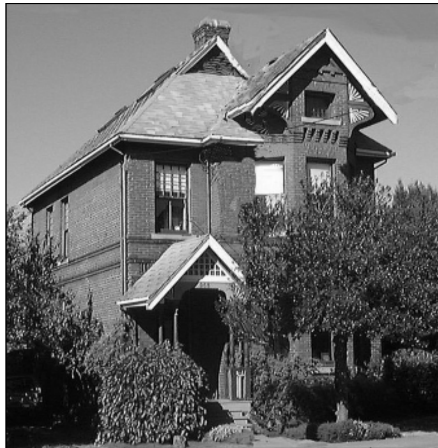
968 Balmoral Road, Victoria, BC

For information in the Victoria area, contact the Victoria Heritage Foundation: Tel: (250) 383-4546 Fax: (250) 389-1864 E-mail: vhf@pinc.com Website: www.vhf.city.victoria.bc.ca