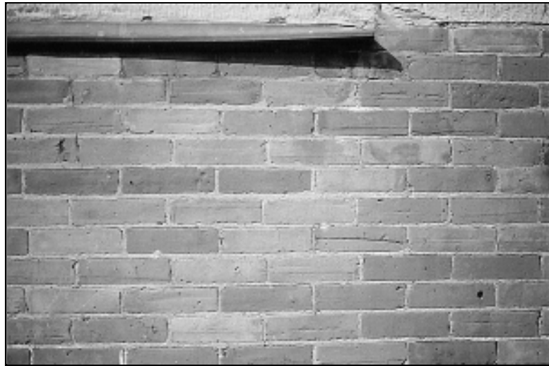
An excellent example of repointing: the repairs are virtually undetectable, and the colour and jointing style match the original exactly, with no excess mortar on the face of the brick.

In addition, the strength of the mortar mix is important. The least strong Building Code mix is type K with a S:L:C ratio of (12:2:1), which has a nominal strength of 60 psi (0.4 kPa). For most historic brickwork, this mix is satisfactory. For most stones, the strength issue is less critical, and the higher portion of cement is acceptable.