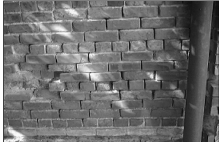
Deterioration of pure lime mortar: weathering by rain and wind has removed much of the soft mortar. In the lower part of the wall, the bricks have actually been displaced, and rebuilding is required. The brickwork in the upper part can be repointed.