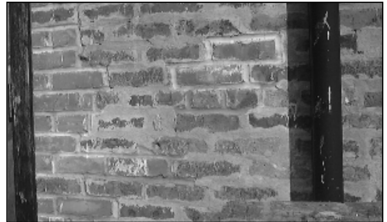
Extremely poor repointing showing many errors: the new mortar, which has a high cement content, does not match the original in colour or strength. The application has been smeared onto face of brick and cannot be removed. The jointing style is also inappropriate.

Repointing is the process of raking out one to two centimetres of mortar from the joints of brick or stone and replacing it with new mortar. It is required where mortar has deteriorated by weathering (often due to uncontrolled rainwater) or when structural movement has opened up the joints. Repointing should be applied only where necessary. Removal of sound mortar for the sake of doing an entire wall, for example, is structurally unnecessary and can lead to damage of the masonry units. Instead, effort should be put into closely matching the pointing mortar to the colour and texture of the existing mortar.