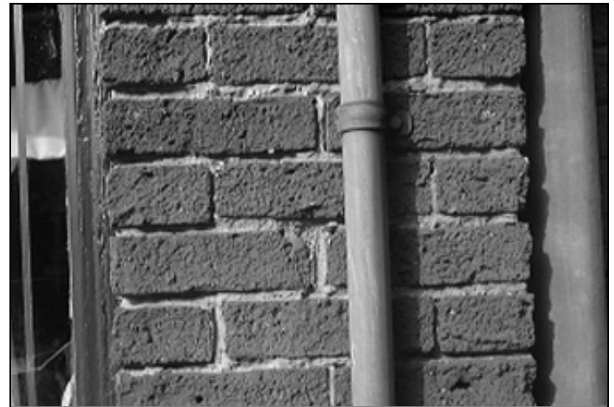
Brick damaged by sandblasting: the smooth surface of this locally made brick has been removed by sandblasting, producing a rough open surface that is not only unattractive but is also more vulnerable to weathering and water penetration and difficult to clean.