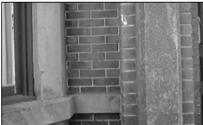
Traces of tuck pointing: the lime mortar has been struck flush and coloured to match the brick, and fine lines of "bastard" pointing have been applied.

Wind erosion can occur with soft brick, stone and mortar in exposed locations. Similar damage is caused by sandblasting, which is not an acceptable treatment for masonry. Chemical stripping is generally the best method for paint removal.