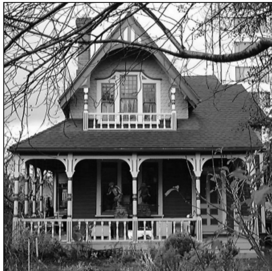
132 South Turner Street, Victoria, BC