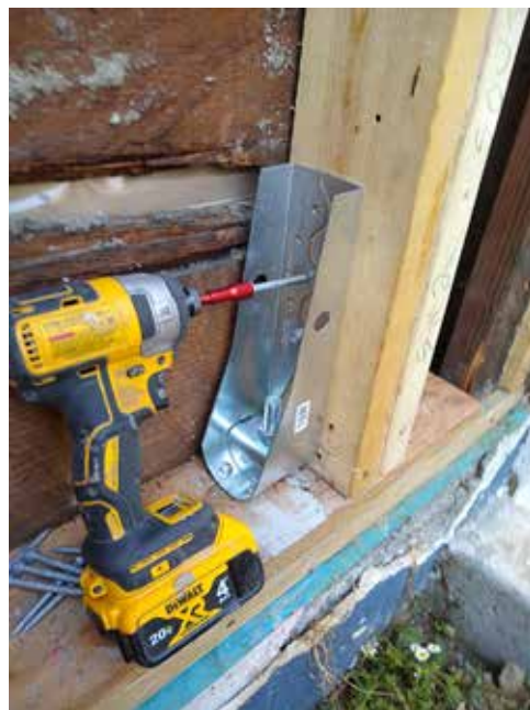
Hold-downs are installed at each end of all shear walls to resist uplift forces.