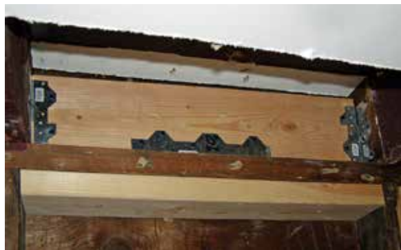
Shear transfer ties connect the top of the cripple wall to the joists above and the floor diaphragm to the top plate.