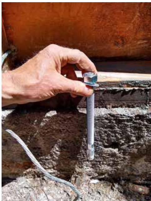
Anchor bolts strengthen the connection between the sill plate and foundation.