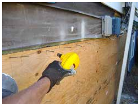
Cripple walls are sheathed with plywood fastened in a tight nailing pattern.