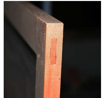
Fig. 1 Through-mortise and tenon joint