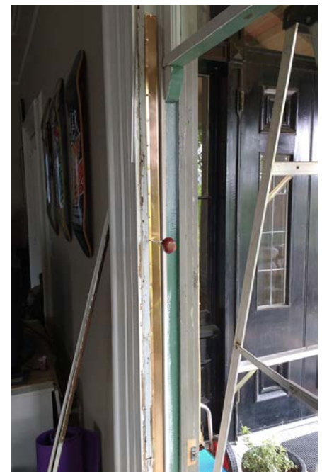
Fig. 2 Spring bronze weatherstripping installation in sash channel of double-hung window