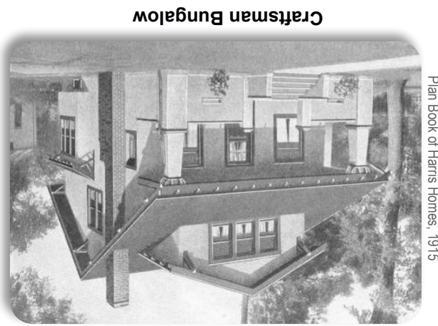
Plan Book of Harris Homes, 1915

North American A&C style in natural building materials. (1900-1930) Craftsman Bungalow