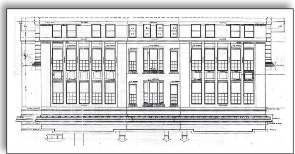
City of Victoria plans

Burnside Elementary School 1912 R Architect C. Elwood Watkins designed three brick schools in Victoria during the building boom: Burnside, Oaklands and Vic High. Due to declining enrolment this school closed in 2006. In 2018 rehabilitation including seismic upgrades began.