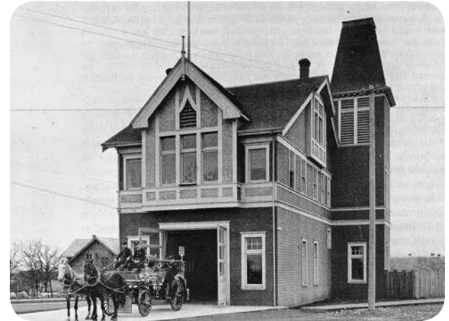
Cedar Hill & Fernwood Rds, Oaklands Fire Hall, built c. 1899, closed c. 1915.