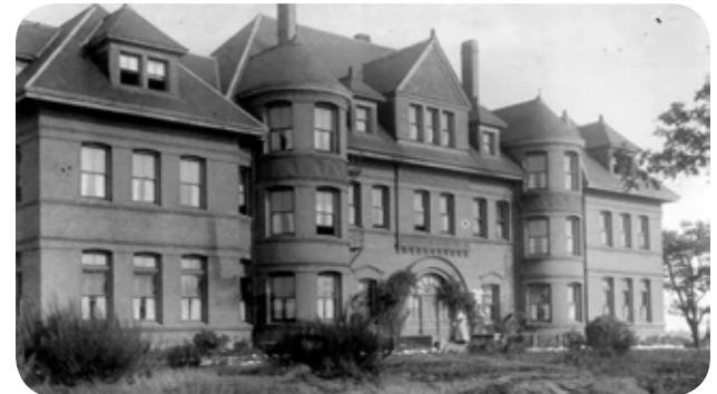
1307 Hillside Ave, Cridge Centre, built 1893 as BC Protestant Orphanage, architect Thomas Hooper. Photo: early 1900s, Salt Spring Island Archives, 50544