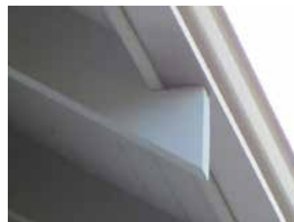
Fig. 1 Notched rafter ends