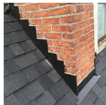
Fig. 1 Chimney stepped counter-flashing