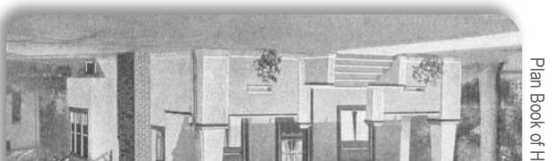
Plan Book of Harris Homes, 1915